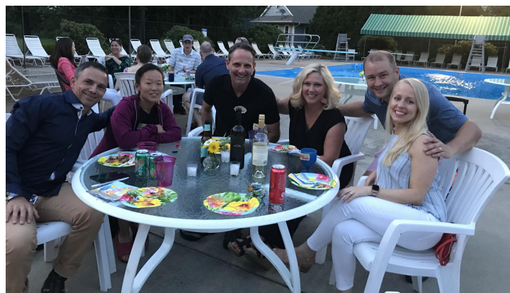
Adult Poolside Party, page 4