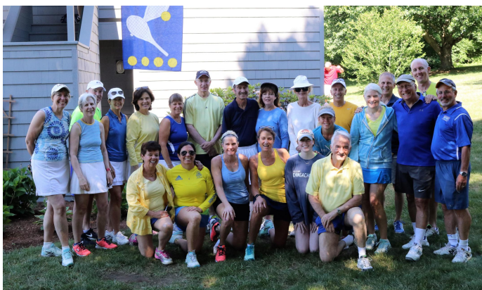
Davis Cup results, page 6